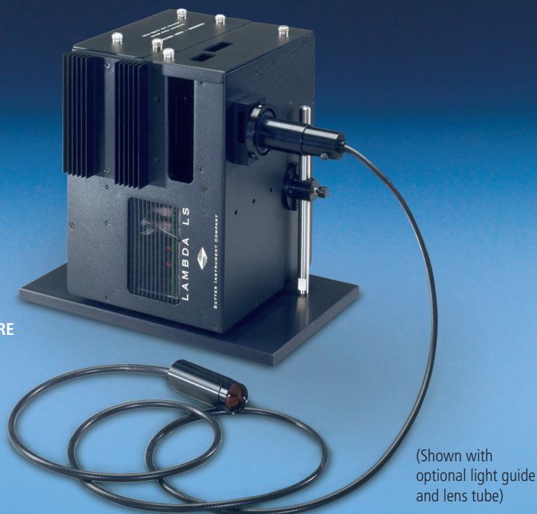
(Shown with optional light guide and lens tube)

CAN BE COUPLED VIA A LIQUID LIGHT GUIDE TO MANY STANDARD MICROSCOPES – NIKON, ZEISS, LEICA, AND OLYMPUS