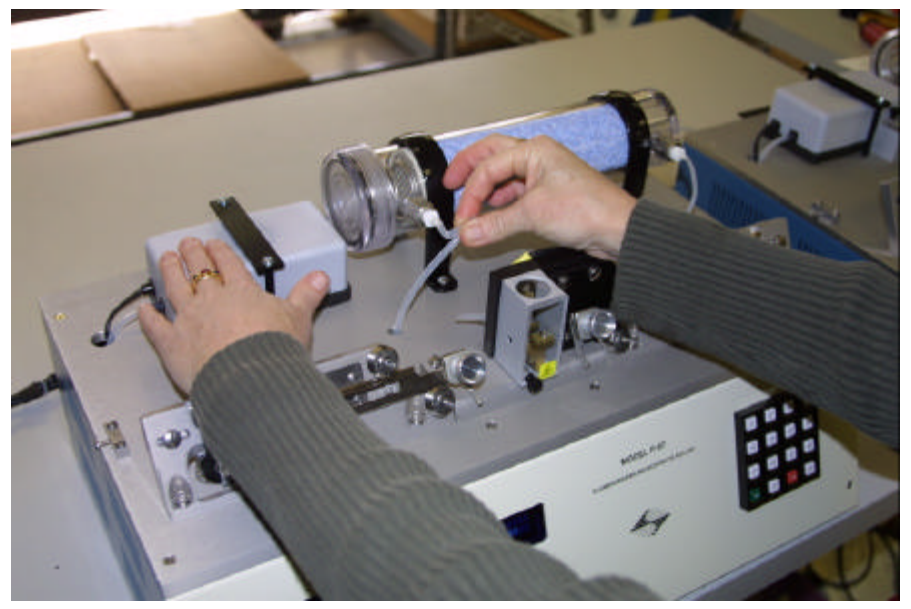
Pinching off tubing from Left Port of Drierite Canister

Step 3) If the pump does not stop, fold and pinch in half the tubing running from the left port of the Drierite canister (Image C) and see if this causes the pump to stop running. If this does cause the pump to stop running, you might have a hole in your tubing or the Drierite cap is loose. It is possible and quite common to develop an air leak after replacing the Drierite Granules since the cap to the Drierite canister can easily get cross threaded or placed on too loose. Please remove the canister, remove the cap, place a little vacuum grease on the black o-ring, and make sure the o-ring is in place and there are no particles or granules on the edge of the canister. Press down evenly on the cap to compress the spring, and tighten the cap. Reconnect the tubing and see if you have fixed the air leak.